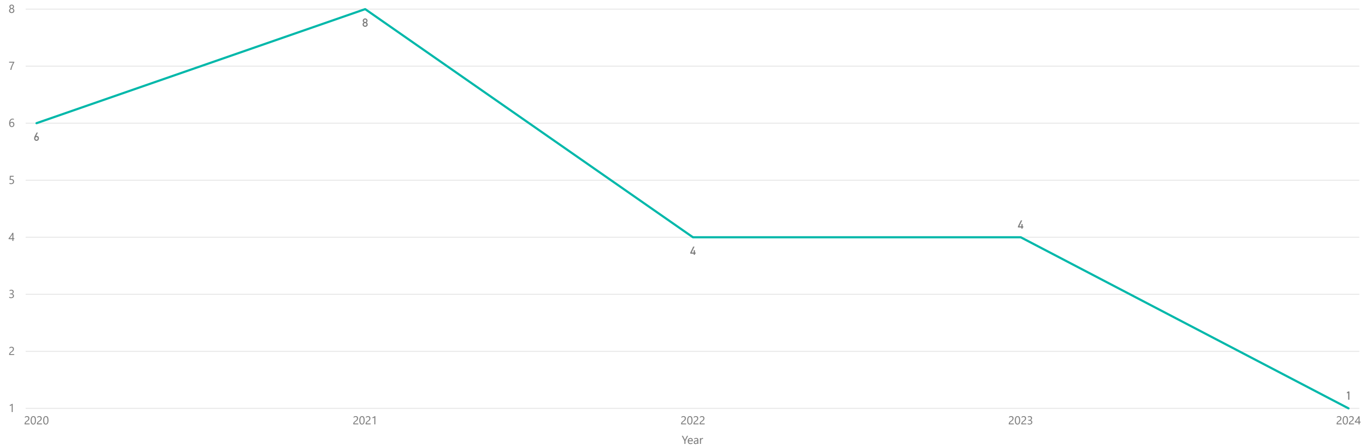
Number of Project Being Let By Year